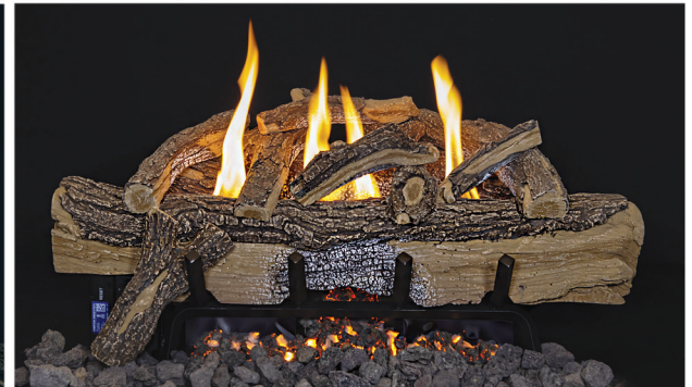
30" Split Oak Gas Logs

All Vent-Free log set styles available in 3 sizes: 18", 24" or 30"