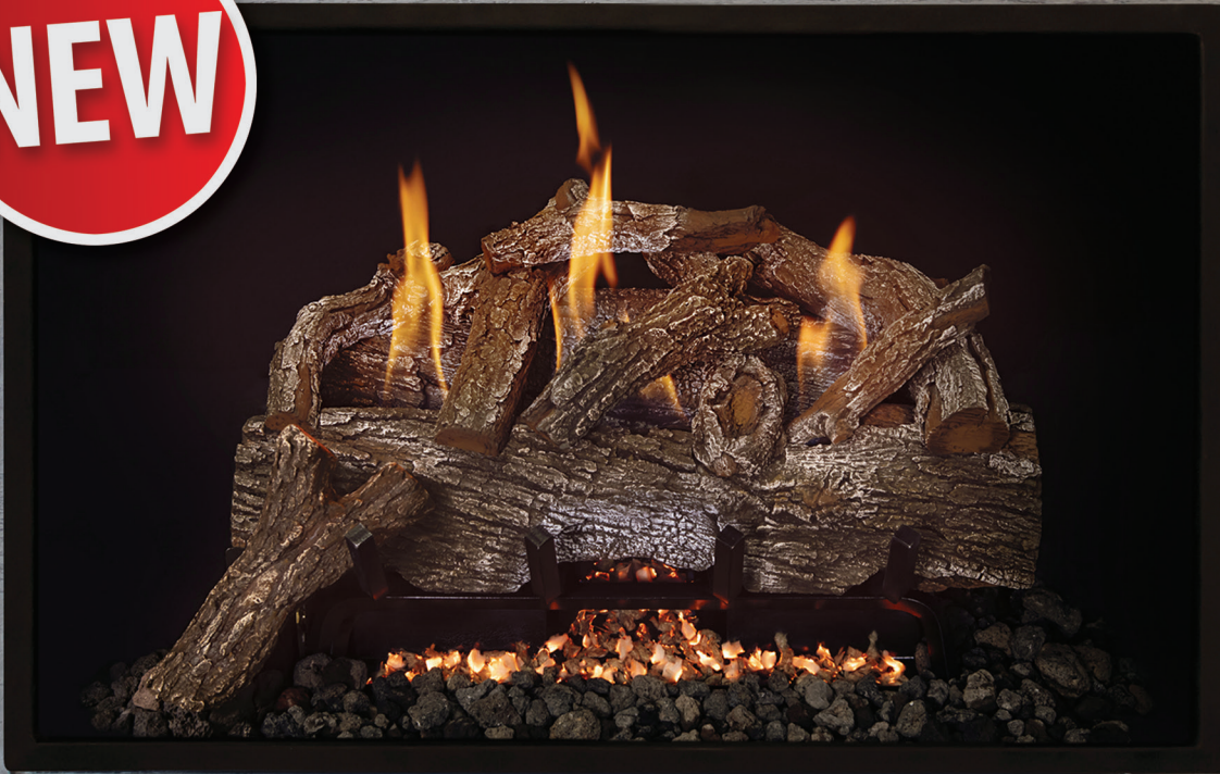
24" Red Oak Gas Logs Log Count 10 - Vulcan Vent-Free Burner