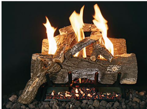
18" Weathered Oak Gas Logs