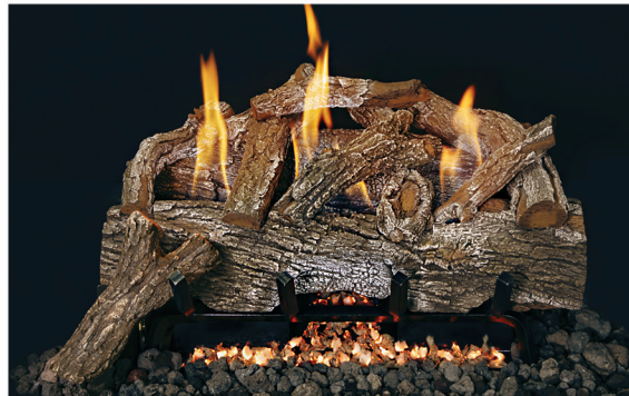
24" Red Oak Gas Logs